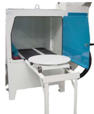
PanBlast™ PB1500 with optional track and trolley assembly