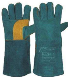
South Paw Welding