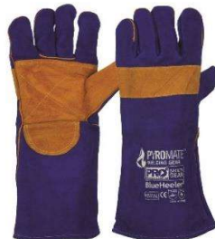
Blue Heeler Welding