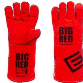
Big Red Welding