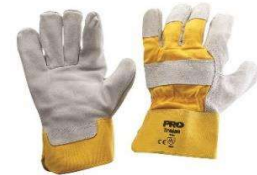
Chrome Work Glove