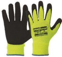
Hi-Vis Latex Foam